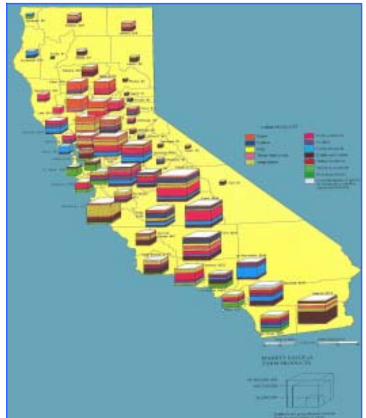
Figure 2. Agricultural commodities of California and their geographical distribution.