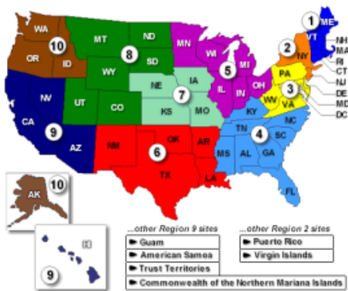
Figure 1. Map of the United States showing the division of the nine water districts as established by the EPA. Map is courtesy of the USEPA ( http://www.epa.gov/ceppo/sta-loc.htm ).

Even though all RWQCBs are following the PCWQCA, the regulations that have been developed differ from region to region. In San Diego (Region 9), runoff is limited to only storm water, excluding the runoff from the first storm event, which must be captured. Because of this 'zero runoff' policy, TMDLs and other similar regulations pertaining to runoff water have no applicability in the San Diego Basin. In the Santa Ana Basin (Region 8), runoff is allowed, but a WDR must be issued. Many physical and chemical restrictions must be followed according to the Santa Ana Basin Plan (Table 2). One of the most restrictive is the electrical conductivity (EC), which must not exceed 2.0 dS/M. This is challenging for most nurseries in this area, since most irrigation water is derived from the Colorado River, which usually has an EC of 1.5 dS/M. In the North Coast (Region 1), WDR are required, but only during the con-