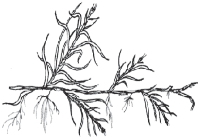
Figure 1. Kikuyugrass stolon showing rooting at nodes.

Adapted from: Pest Notes, Publication 7458, Revised April 2003. Produced by IPM Education and Publications, University of California Statewide IPM Program.